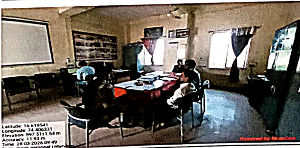
Mock Personal Interview organized by the Commerce Department.