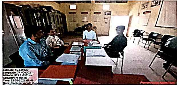
Students participating in the Mock Personal Interview organized by the Commerce Department.