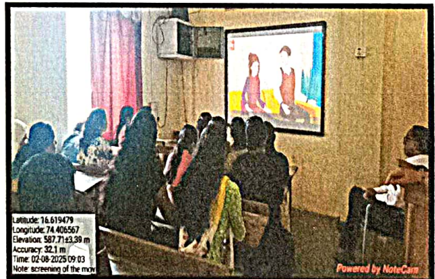
Percipients, Students & Faculty