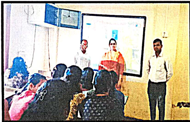
Inauguration of Screening of the Movie Activity