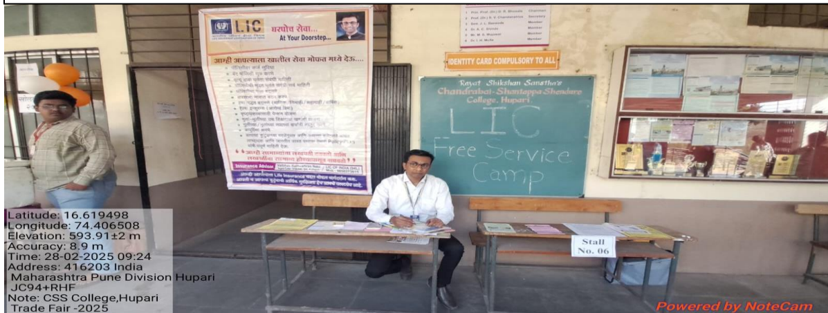
Life Insurance Corporation of India's insurance advisor consulate visitor for investment in insurance at 'Trade Fair-2025' on 28/02/2025.