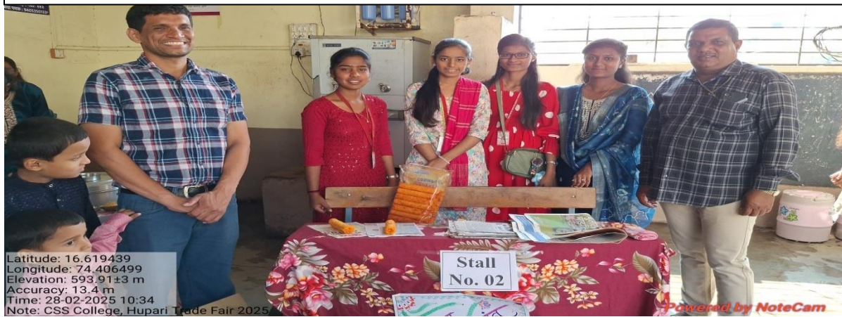
Students participated with food stall at 'Trade Fair-2025' on 28/02/2025.